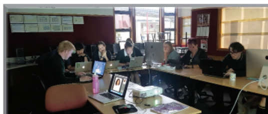
Students hard at work learning Photoshop techniques