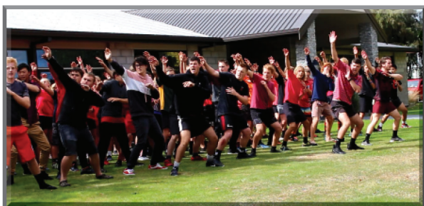
Whole School Haka