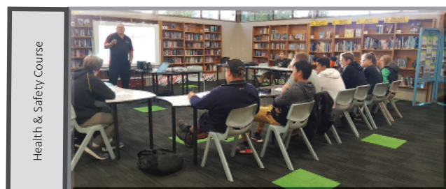
Health & Safety Course

The course has been specifically designed to give students an appreciation of some of the main concepts of safety in the workplace. The course is interactive, has lots of visual/tactile aids and has a fun element. At the completion of the course, students will have an understanding of Health and Safety legislation, know how to spot and evaluate hazards in a range of different industries and be able to write a work plan to mitigate the risks involved.