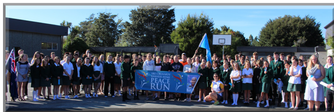
Whole School Farewelling the Peace Run team

As well as talking about the ethos of the Peace Run, the group talked about the events in Christchurch and environmental issues. They also taught the students an interactive song and ran a short quiz on where they were from.