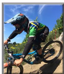
Do the brakes work?