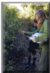
AJ & Crystal identifying plants