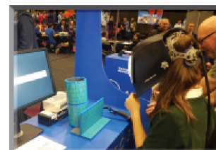
Virtual Reality Welding Simulator

Reminder - Diaries to be signed and handed to form teachers on FRIDAY!