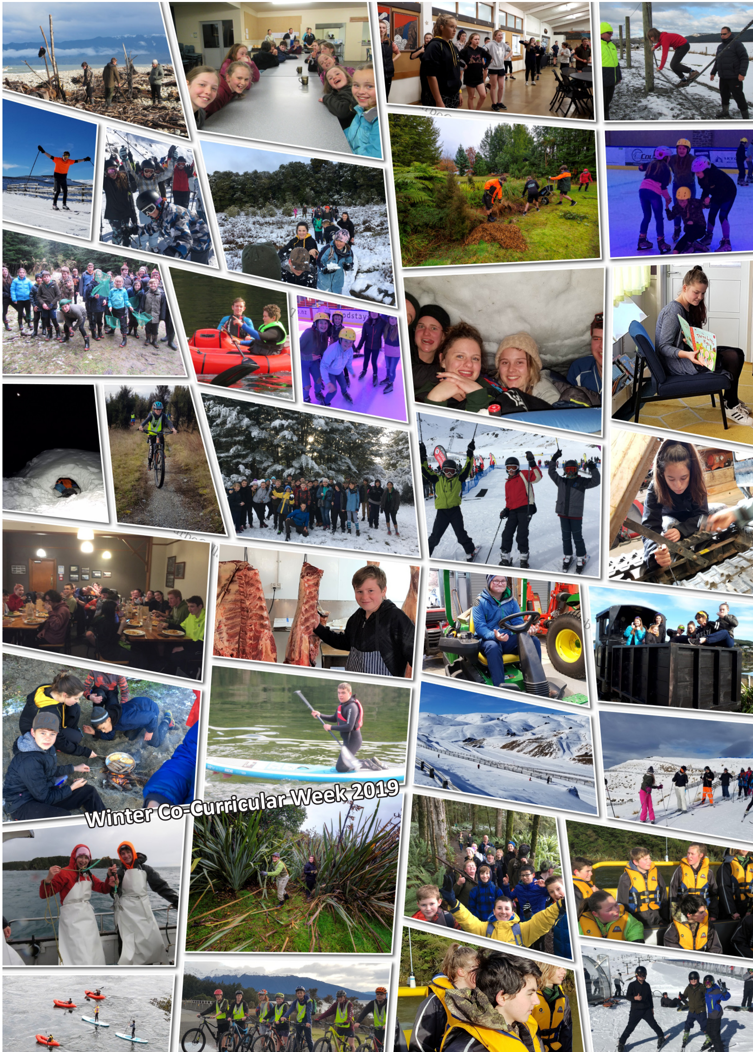
Winter Co-Curricular Week 2019