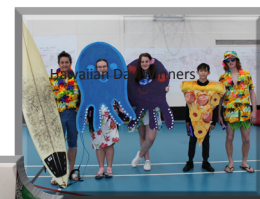
World Cup Day - Winners