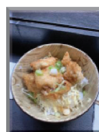
Tori ten don